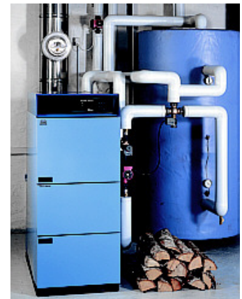
Baxi log boiler and accumulator tank

Large space needed for boiler and accumulator Large storage space needed for logs Fuel needs processing / stacking / loading Can be hard to source seasoned logs High capital costs