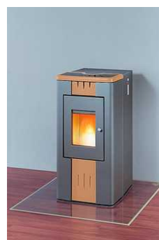
Rika Pellet Room Heater

A pellet room heater with back boiler could provide a more controllable heat source, whilst still providing a 'living flame' in the sitting room. As with a log stove, a pumped system would be needed to provide hot water to the domestic hot water cylinder and to the radiators downstairs.