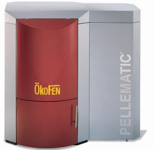
Okofen Pellet Boiler

8 tonnes of pellets might cost around £1,568 per year, depending on quantities delivered. As with log boilers, switching from a woodstove to a central heating system can see a rise in fuel bills because of increased heating demand and comfort levels.